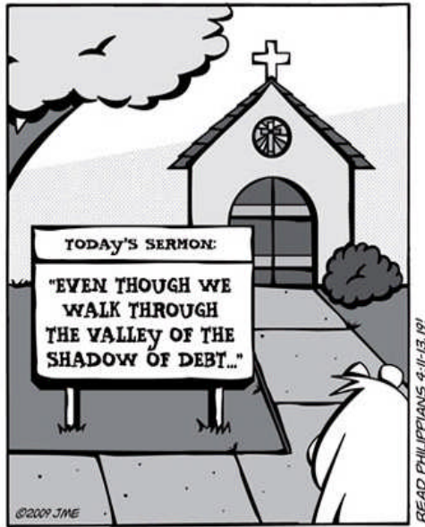
Needless to say, the fall stewardship drive took on a decidedly different tone this year.

Virginia Heights Baptist Church 2014 Memorial Avenue, SW Roanoke, VA 24015-2032